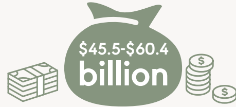
Direct and indirect costs associated with ABI. 3