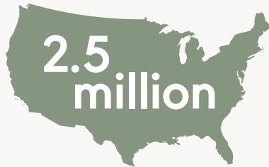
Number of individuals who experience an ABI each year. 1,2

ABI is a serious public health problem in the United States.